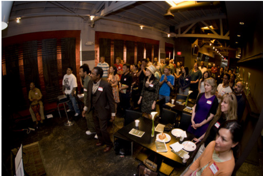
Singing praises to God