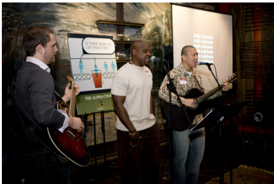
Our praise team